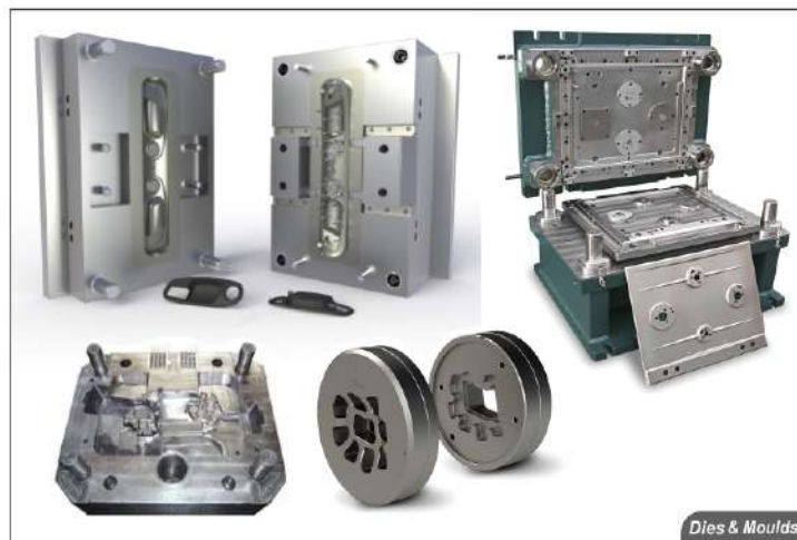
Dies & Moulds